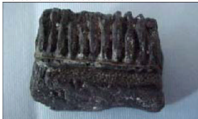
A thinner ray tooth, measuring 7/8 inch long and 1/4 inch wide. Note the ridges on the grinding surface.