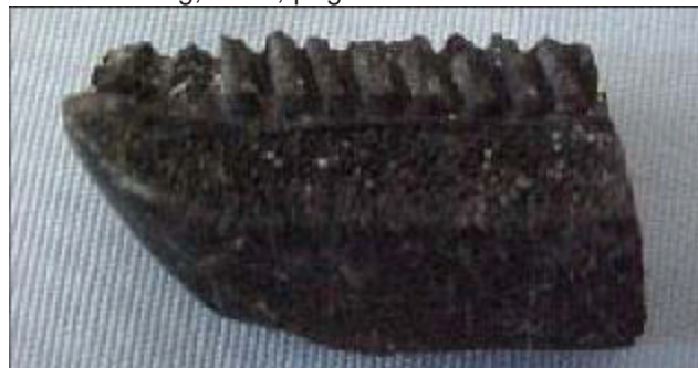
Ray tooth measuring 7/8 inch long, 3/8 inch thick. Note the ridged grinding surface, rectangular shape of this tooth and the tar black coloration.

Reference: Cartmell, B. Clay, Let's Go Fossil Shark Tooth Hunting, 1993, page 38-43.