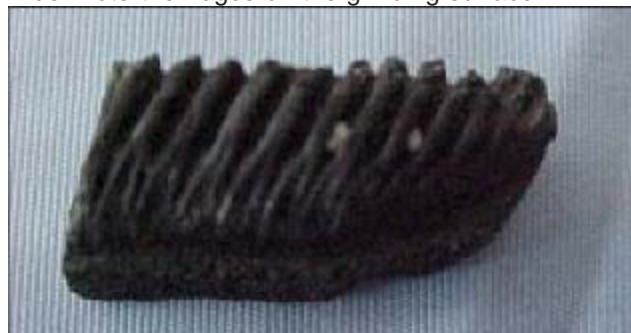
Note the black porous bone-like material and the rectangular shape of this ray dentition.