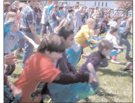
The Treasure Hunt on Saturday was a great success. The kids loved it.