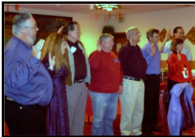
WAMS Officers for 2004