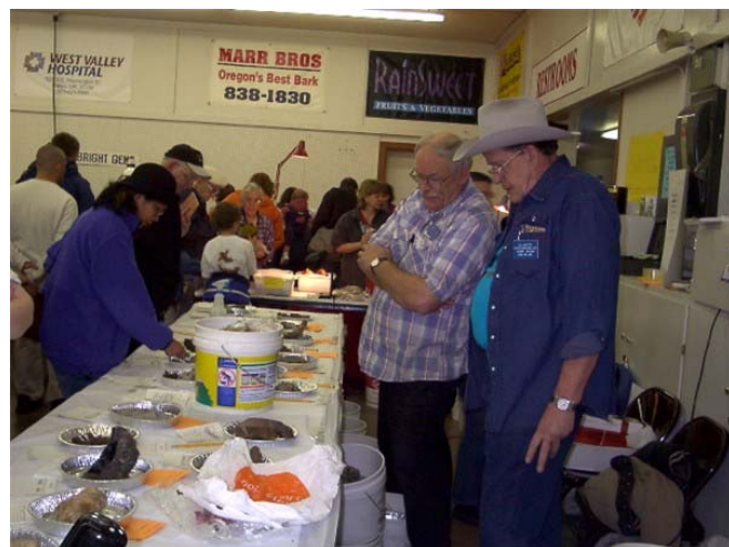
The Silent Auction was a very popular attraction

This year, we were also fortunate to have two excellent articles about the show published in the Statesman-Journal newspaper. This certainly increased our visibility in the Salem area communities, and hopefully increased our attendance throughout the show.