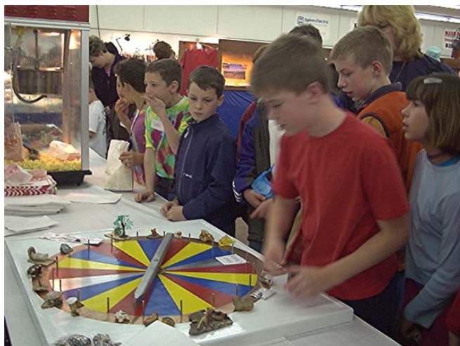
Future rockhounds enjoying the Friday show