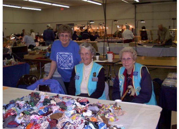
The lovely ladies of the Grab Bag table