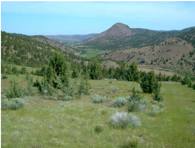
View of the Marston Ranch area