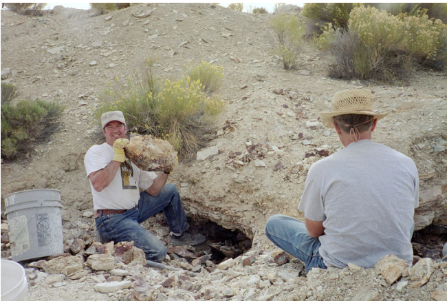
More McDermitt treasures