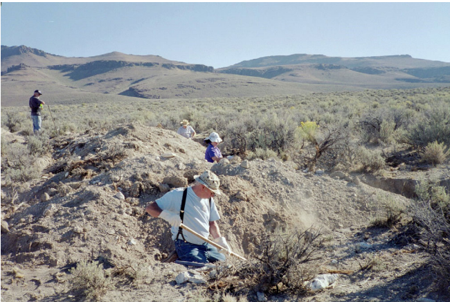
Recent fieldtrip to McDermitt – Photo by Theresa Byrne