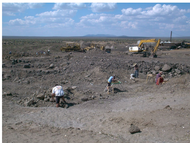
Dust Devil Mine activity