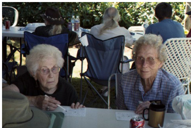
The ladies await the right number for a B-I-N-G-O

Lost and Found - Two Riker Cases found near Stayton with specimens. Call 503-897-3280 and identify if you lost them.