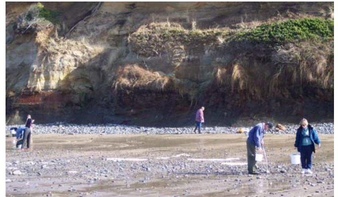
Members search the exposed gravel

Saturday evening found thirty-plus members at the Sizzler for some "show and tell" and the replenishing of some calories.