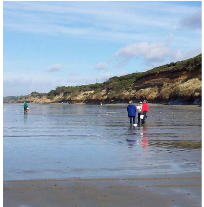
A beautiful day at Lost Creek