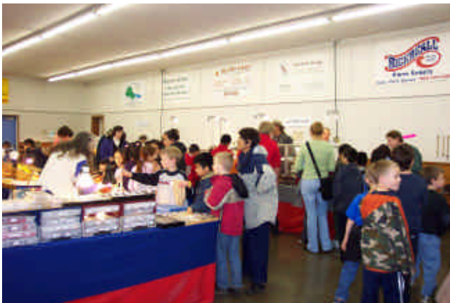
The kids kept the dealers busy on Friday

Our 50 th annual show is now history, and early reports indicate the show was very successful. It has been estimated that overall attendance was over 4,400, and over 1,100 schoolchildren and chaperones attended the show on Friday.