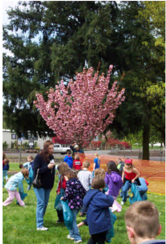
Scrambling for treasure