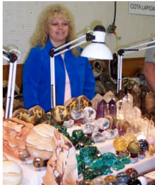
Cota Lapidary's fine selection – Photo by J. Owens