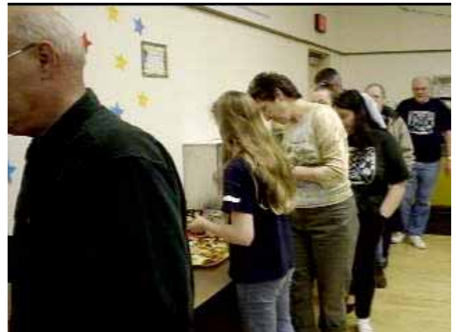
Break Time and Food!!!!