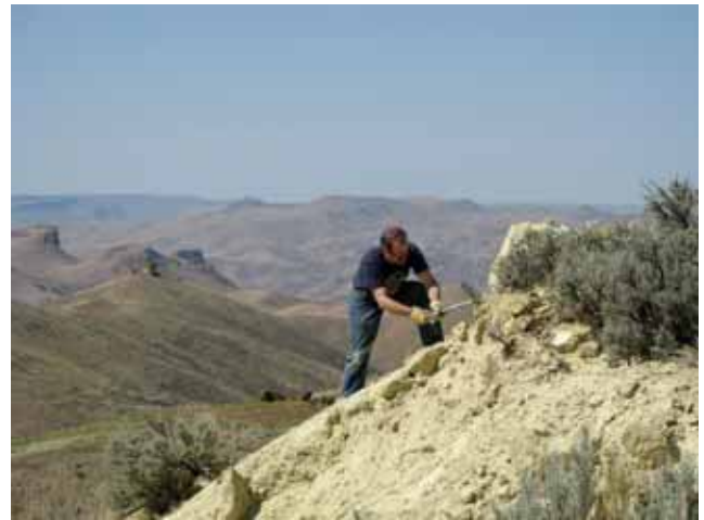
-submitted by Theresa Byrne