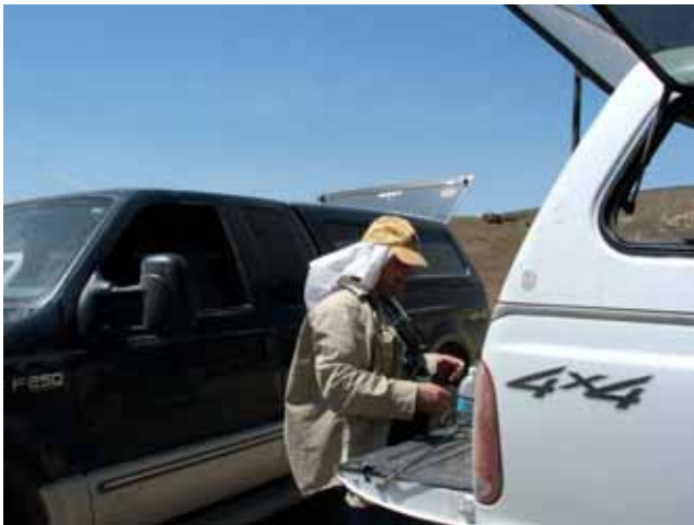
-submitted by Kay Storey