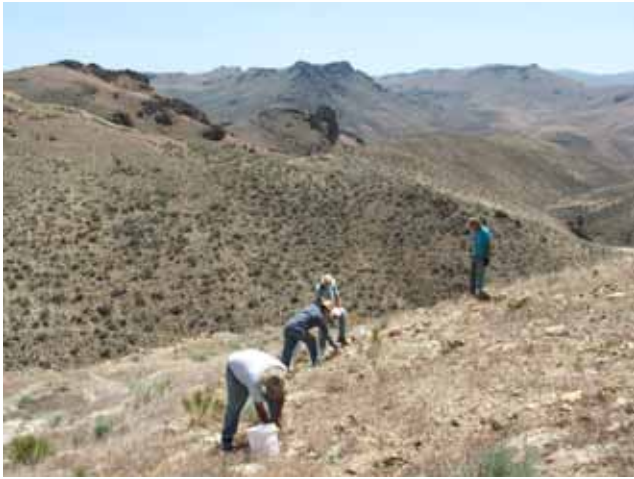
-submitted by Kay Storey