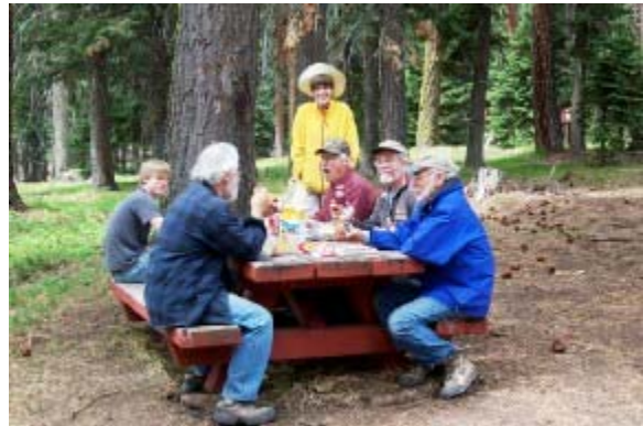
Group at Campground