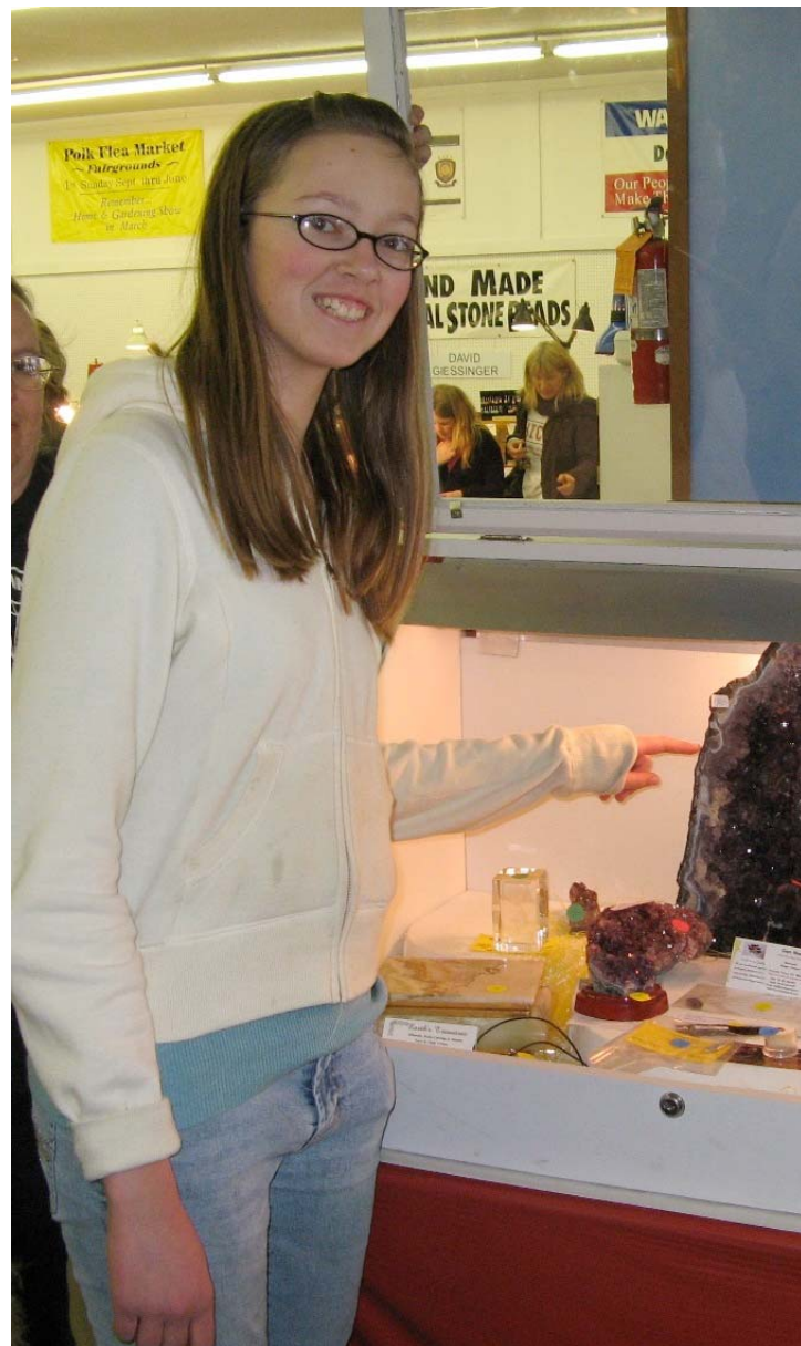
Happy winner of Amethyst Cathedral ~submitted by Theresa Byrne