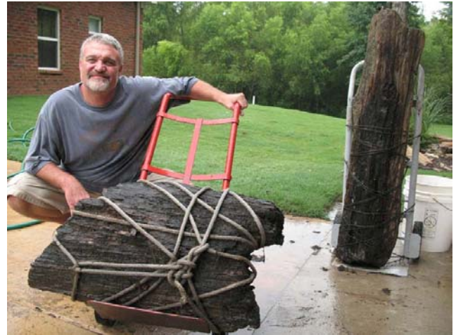
Part Site 2. These two large pieces were collected about 1 ½ miles from the access point and within about fifty feet of each other. To get them from the creek bed to the driveway required the following: one pick-up truck, one trailer, one canoe, one GPS system, two days, two hand trucks, two dogs, four rockhounds and several feet of rope.

Fortunately there were a lot of good pieces that made this task worthwhile.